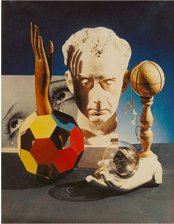
FIGURE 31. Man Ray, “Still Life”, 1933.

suspended inside a frame. Space perception, thickness and volume, are generated through the artifact of shadows, that each shape, as well as the frame itself, cast upon a background wall, whose existence is only highlighted by its role as the recipient of the projected shadows. The shapes are purely abstract and yet, the central one, which mediates between the curved and the flat,