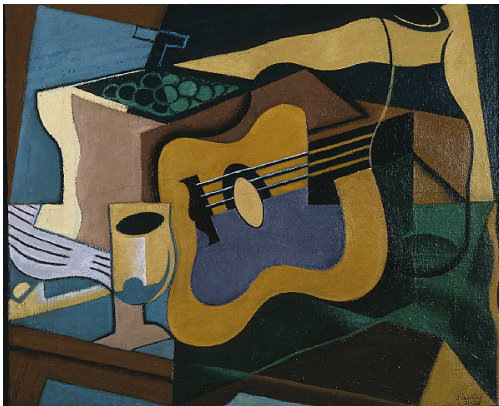
FIGURE 10. Juan Gris “Still life with Guitar”, 1920.