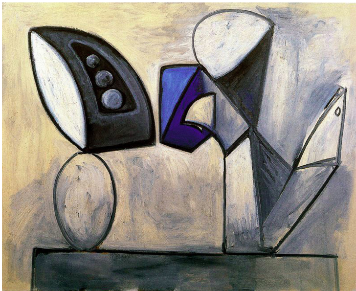
FIGURE 21. Picasso, “Still Life”, 1947.

way. Space in this still life is created by massive volumes with no other meaning left but their bending of spacetime itself.