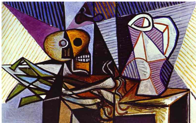
FIGURE 13. Picasso, "Still Life", 1945