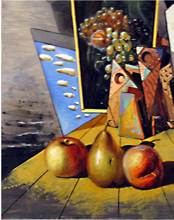
FIGURE 32. De Chirico, “Still Life”.

the genre with his Cézanne-like voluminous shapes of fruits occupying and defining the center of the composition. The reference within the reference is hinted at by the presence of a Still Life painting of grapes within the Still Life painting, the representation of a representation, or a second level of conceptualization.