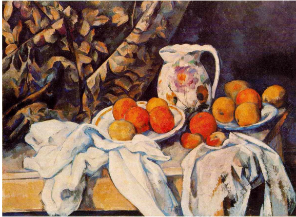
FIGURE 24. Cézanne, “Rideau Pichet”.

3.2. Cézanne’s curved space. Throughout the history of philosophical thinking about space, as well as in the concepts of modern physics, one repeatedly encounters a dialectical counterposition between a relational and an absolute notion of space. In the relational viewpoint, space itself is created by the interactions between matter and forces, in the sense that there is no absolute reference frame, but the frame itself is bent and transformed by the bodies that occupy it. Measurements of space are measurements of events that happen in space. In contrast, there is a point of view in which space itself is an entity of interest even in the absence of anything else: the vacuum is one of the most interesting phenomena of modern physics, with its own energy due to the bubbling of virtual particles. Empty space can be curved into interesting and non-trivial geometries, even in the absence of any actors on its stage of existence.