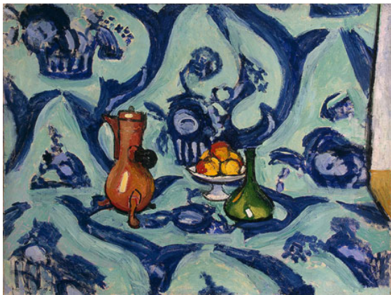
FIGURE 26. Matisse, “Still Life with blue tablecloth”, 1909.