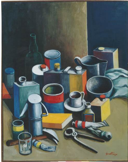
FIGURE 20. Guttuso, "Still Life with cans".

of still life composition from bourgeois household to proletarian workplace. On the other hand, the 1947 Picasso still life achieves a further level of abstraction in the genre, where the depiction of space is openly seen as the ultimate goal, the objects transformed into unrecognizable volume-shapes whose manifest purpose is the creation of space, along the line of our relativistic conceptions, according to which matter bends the geometry of space, hence creating gravity, which in turn influences matter in a dynamical