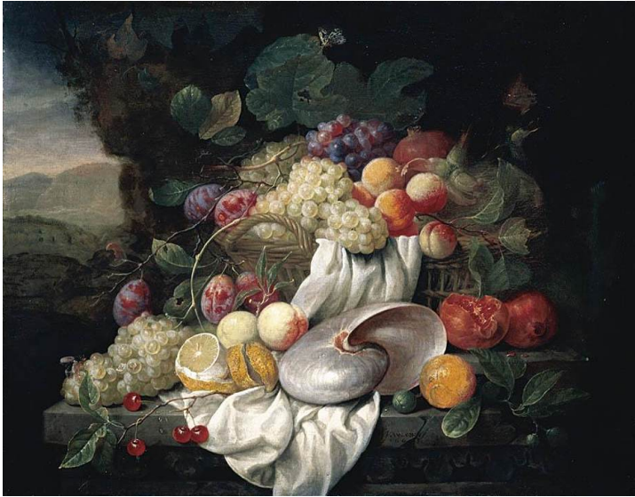
FIGURE 1. Joris van Son, “Still Life of fruit”, 1663.

as non-euclidean geometry, higher dimensions, and the like, and bring them into contact with a drastic revision of what it means to “represent” the everyday objects that surround us, and that come to occupy a profoundly altered concept of space and time. So, I believe, the challenge is a valid one, even in the light of the ever more complex landscape of today’s thinking about the concepts of space and time, and I take the occasion to make an open call here to the practicing artists, to take up the challenge and paint a new chapter of the “still life” genre, suitable for the minds of the current century.