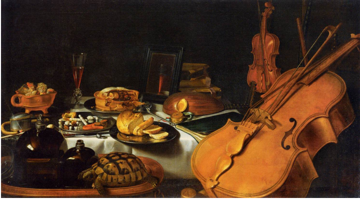
FIGURE 7. Pieter Claesz, “Still Life with musical instruments”, 1623.

temporal component, and that so did theater already in the earlier times, but music, being more abstract, and having essentially no spatial component to it, embodies better than any other art form the image of the flow of time. In times when there was no method to store acoustically (not in the written form of a score) a musical performance, music would also exemplify something that dissolves in time without leaving behind any tangible trace of its existence, hence connecting back to the more general idea of the tempus fugit and Vanitas themes.