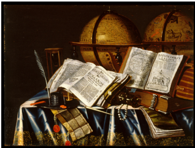
FIGURE 16. Adam Bernaert, “Vanitas”, 1660.

2.6. The flow of time as a flow of knowledge. Time is also perceived as the vehicle for the accumulation and transmission of knowledge, represented by the reading and writing of books: the main instruments for the storage and acquisition of knowledge ever devised in human history.