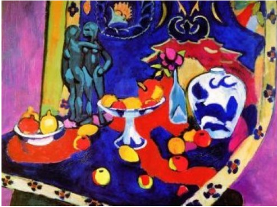
FIGURE 25. Matisse, “Still Life with fruit”.

of any reference to 3-dimensionality, and yet space emerges from relations and interactions, not of spatial locations, but of colors . Thus, in Matisse’s approach, it is the spectrum of light, with the contrast created by juxtaposed masses of color that creates space.