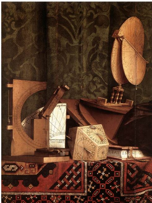
FIGURE 18. Hans Holbein, “The Ambassadors” (detail), 1533.