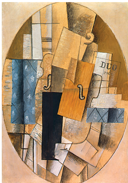
FIGURE 8. Braques, “Still Life with violin”, 1914.

Braques and Picasso, most of all, but also Gris and Leger. The musical instruments in their composition are at the center of a fly-eye perspective of multiple viewpoints, which suggests multiple observers in space as well as multiple instants of time, seen through a more modern viewpoint whereby time and space have started to blend into two no longer separate concepts. Music is then no longer a purely temporal art, but also an embodiment of movement, viewed as a change of observer viewpoint through both time and space.