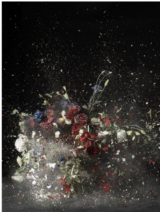
FIGURE 3. Ori Gersht, “Exploding Floral Composition, N.4”.

The theme of floral composition as a representation of instantaneous existence in time, and an embodiment of the concept of Vanitas , reaches its apex with the contemporary artist Ori Gersht, with the “Exploding Floral Compositions”, where 3-dimensional models of XIX century traditional still life floral compositions by Henri Fantin-Latour and then exploding them and photographing them right at the moment of explosion.