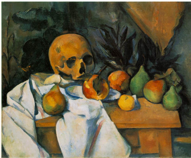
FIGURE 12. Cézanne, "Still Life with skull".