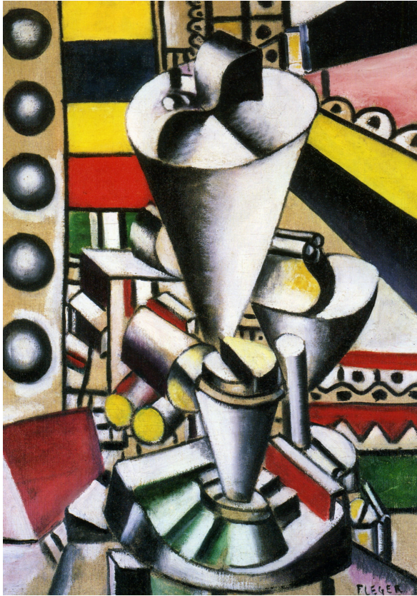
FIGURE 22. Fernand Léger “Still Life in the Machine”, 1918.

Space becomes defined by the machine and it resides in the machine, which is again a dynamical entity, based on rhythmic movement and repetition.