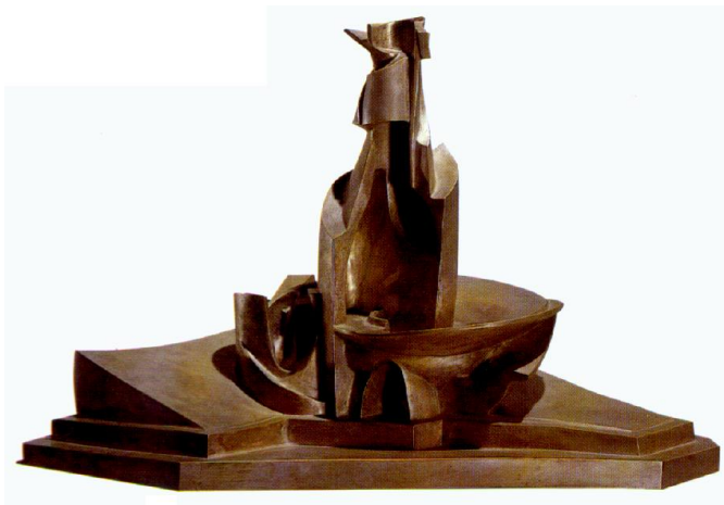
FIGURE 19. Boccioni, “Development of a bottle in space”, 1912.

where they stand in relation to one another, relative to an absolute background coordinate frame fixed by the environmental elements: tabletop, walls. In the transition to XX century art, the objects of Still Life compositions begin to define space itself through their properties of volume (Cézanne) or color (Matisse).