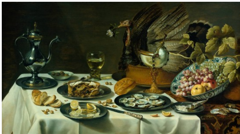
FIGURE 6. Pieter Claesz, “Tabletop Still Life”, 1625.

2.3. The flow of time and music. Time is also perceived and described as a flow, and the most frequently used method for incorporating the concept of the flow of time in still life paintings is through a reference to music. There are various aspects of music that link it to time: unlike the appreciation of the visual art, which is essentially simultaneous and atemporal, and that one may classify as spatial perceptions (though of course a changing point of view in looking at a sculpture may form an important part of its aesthetic appreciation), music can only be perceived in time and through time.