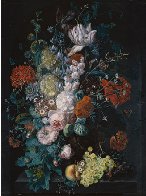
FIGURE 2. Margareta Haverman, “Still Life: a vase of flowers”, 1716

succession of events, or by means of a single simultaneous instant (which would have the effect of abolishing time completely), but through the coexistence of a plurality of instants belonging to different times. This is consistent, as modern neuroscience teaches us, with the internal representation of time in our memory, which we imagine stores a faithful recording of the linear ordering of events, but which in fact resembles much more the floral compositions of the Flemish Still Lives, with a simultaneous superposition of unordered but distinct time events.