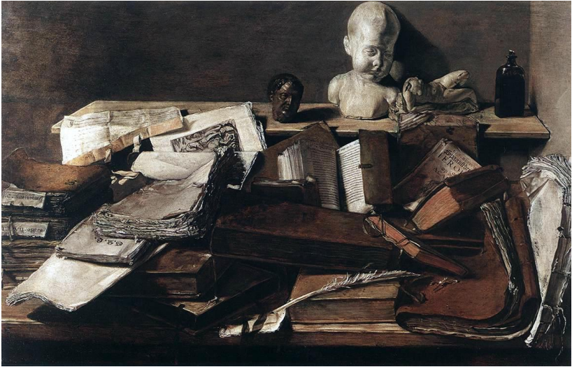
FIGURE 17. Unknown Dutch Master, “Still Life with Books”.

entropy, between the XIX and the XX century, and later Einstein and the newly emerging notions of spacetime in the early XX century. We have so far focussed on concepts of time. We now turn our attention to how the Still Life genre has been expressing the concept of space.