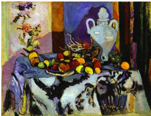
FIGURE 27. Matisse, “Blue Still Life”, 1907.