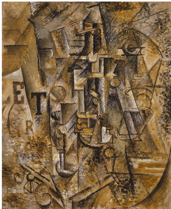
FIGURE 29. Picasso, “Still Life with bottle of rum”, 1911.

3.5. Dadaism: spacetime as information. The Still Life genre also makes an appearance in one of the most unlikely places within the landscape of the XX century avant-garde: Dadaism.