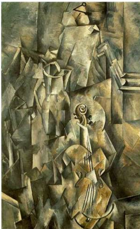
FIGURE 28. Braques, “Still Life with violin and jug”, 1910.

is natural for us to see in them a portrait of spacetime, rather than a space and time, and one where the notion of simultaneous observers is brought into question.