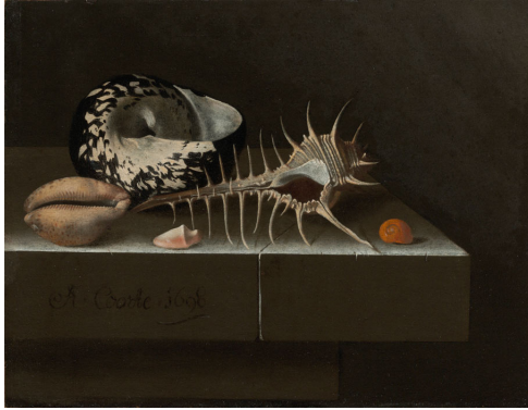
FIGURE 14. Adriaen Coorte, “Still Life with seashell”, 1698.

2.5. The algorithmic time of seashells. There is yet another way in which we have come to understand the unfolding of time, which is through the processing of an algorithm, said in modern information theoretic language. A natural process of growth that follows an algorithmic regularity, which we nowadays like to think of in terms of cellular automata and discrete dynamical systems, is the growth of seashell. The algorithmic regularity of geometric form and patterns in sea shells have long fascinated scientists and naturalists alike. The frequent insertion of seashell as a theme in still life can be seen as describing yet another aspect of time, which is stark contrast with its view as thermodynamic decay and slow destruction. In fact, the regular geometric growth of seashell is an example of time evolution that encodes and does not lose information, which is to say, does not represent an increase of entropy but of its opposite, information.