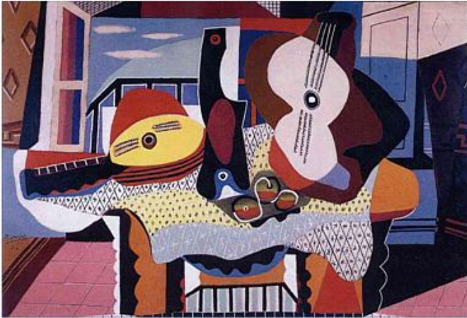
FIGURE 9. Picasso, “Still Life with mandolin”, 1924.