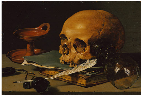
FIGURE 11. Pieter Claesz, “Still Life with skull and writing quill”, 1628.

2.4. Decay and thermodynamic time. Among the notions of time that modern scientific thought developed, perhaps the one that comes closest to our subjective perception, as well as to the notion of Vanitas we have been discussing here, is the concept of thermodynamic time . What is meant by this is the formalization, through the mathematical notion of entropy in thermodynamics, of time as consumption and decay, and the irreversibility of the arrow of time.