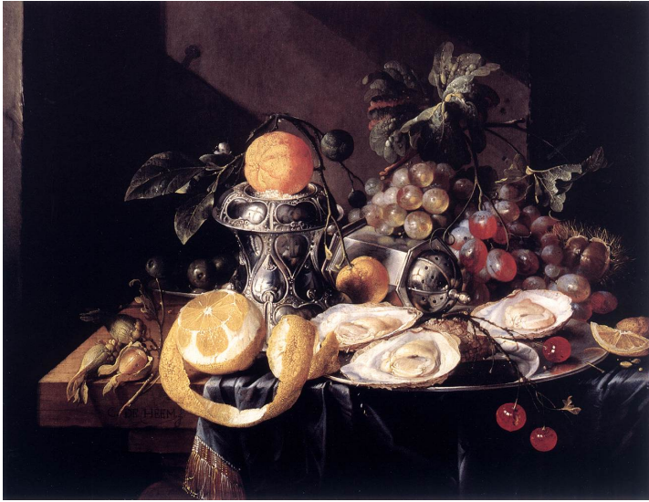
FIGURE 4. Cornelis de Heem, “Still Life with oysters, lemons and grapes”, circa 1660.

We know today, thanks to the fast advancing technique of femto-photography, that one can push this idea of capturing the instant of time to the point of photographing light itself in the process of moving at its extraordinary but finite speed through various materials. One can view this as the modern evolution of the idea the still life painters of the XVII century were trying to convey with their “collection of instants” embodied by perishable flowers in multi-seasonal floral compositions.