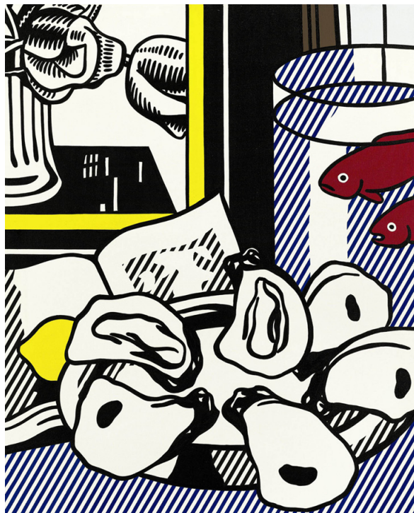
FIGURE 5. Roy Lichtenstein, “Still Life with oysters, fish in a bowl and book”, 1973.

suspended in an instant frozen in eternity. The use of seafood in still life as an emblem of the perishable persists well into the XX century redefinition of the genre. It makes frequent appearance in Picasso’s Still Lives and continues to be a referent for the genre, through other artistic movements, like Pop Art, well into the second half of the XX century.