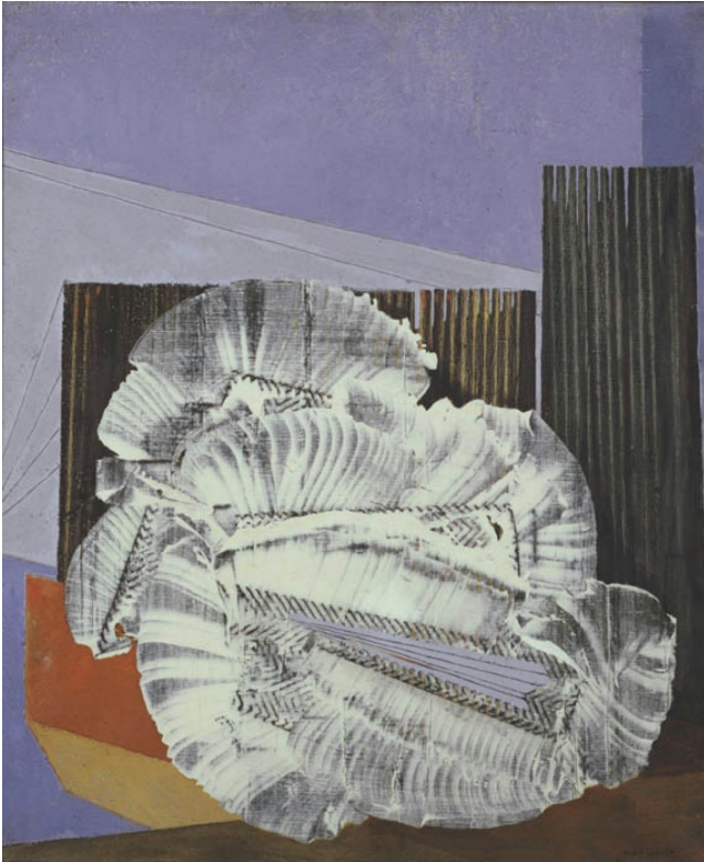
FIGURE 15. Max Ernst, “Sea Shell”.

The algorithmic growth of seashells is a process that represents, once again, the unfolding of time, but now in a creative rather than destructive form: the creation of structure and the execution of a code, a program, into a mechanism of growth. A process of creation and evolution of form through time.