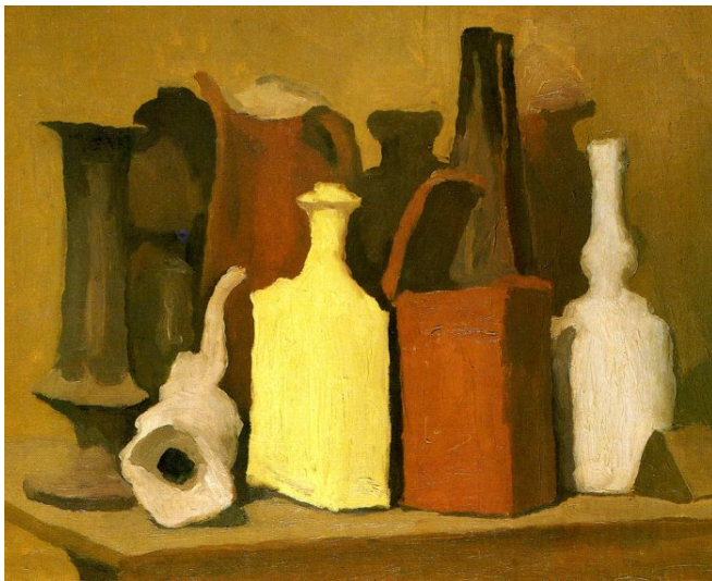
FIGURE 23. Morandi, “Still Life”, 1929-1930

3.1. Existence as space without time. In contrast with the dynamical space of the Futurists, there is an absolute stillness, which can only be defined as space in the absence of time, which emerges in the many Still Life paintings of Morandi, mostly arrangements of bottles, vases and glass containers on a barely defined tabletop, with usually no other clear delimitation of surrounding space. It is an indefinite space, an apeiron , as far as the background framing is concerned, while it is a tightly bound image of proximity relations in the cluster of objects occupying and defining the center stage of the painting. There is little room for both volume and color to play a role in these paintings, where the depth of space is meager and a diffused light permeates a muted balance of ochre tints. Space here is absolute stillness.