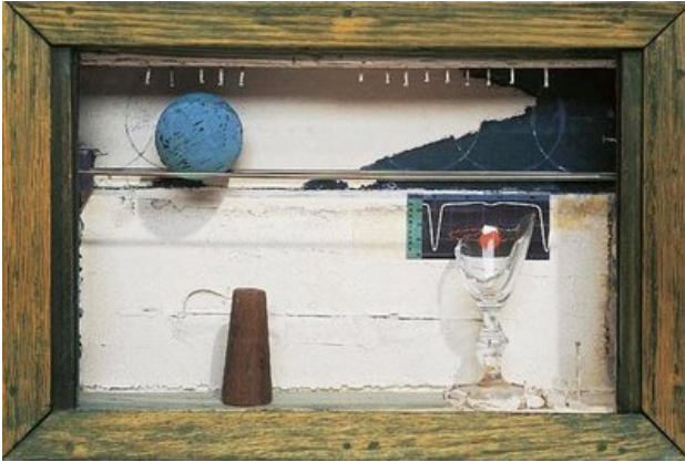
FIGURE 33. Joseph Cornell, “Eclipsing Binargy Box”, 1972