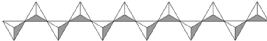
FIGURE 2. Tetrahedra in a single-chain configuration.

silicates and Si-Al minerals (see §6 of [30]). Example of such Ising model analysis can be found in [19], [21].