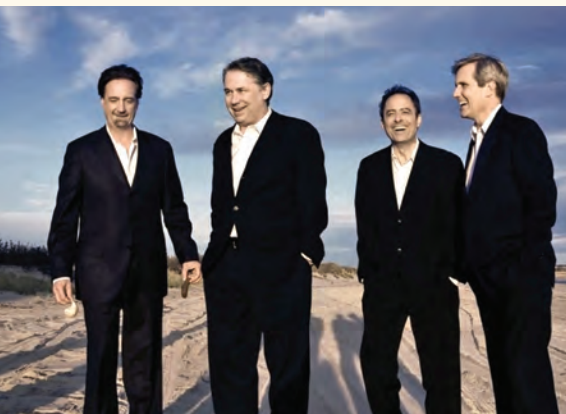
Emerson String Quartet