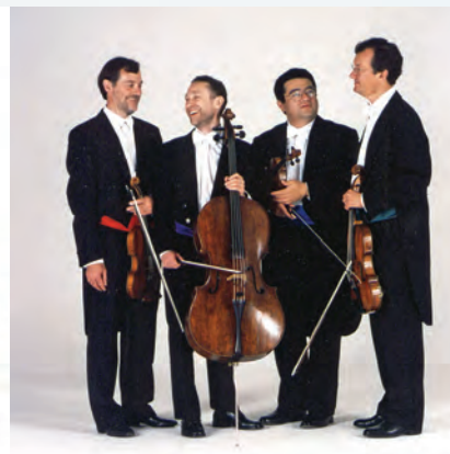
Endellion String Quartet