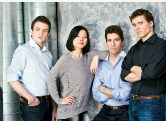
Escher String Quartet