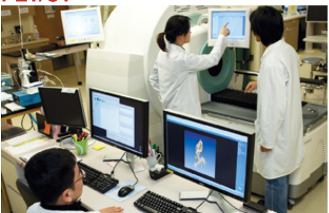
NEW USES FOR PET/CT: Researchers at UCSF, like those depicted here, use a PET/CT scanner to track the distribution of their therapy throughout cancer tissue. Elizabeth Fall