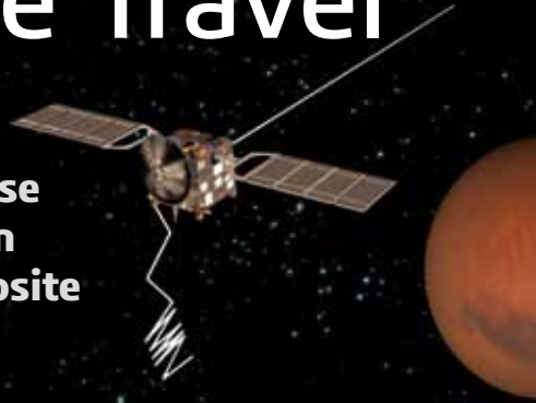
Figure 1. MARSIS satellite nearing Mars, showing one composite antenna boom already deployed and a second boom in the process of unfolding.

Caltech researchers use Abaqus FEA to design self-deploying composite booms for satellites