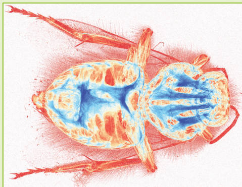
Color image of a bumblebee taken with Medipix3 on silicon, 55µm pitch, 7x8 tiles, 20kV / 100µA / Mag. 4x, Object height ~25mm.

The experience gained in the continued development of these imaging circuits has come full circle and the latest chip in this series, Timepix3, meets the requirements for the LHCb upgrade experiment with minor modifications.