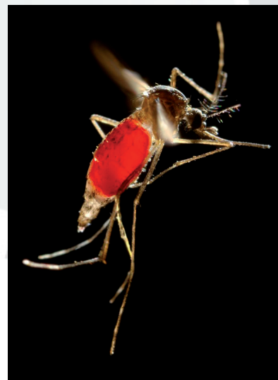
The dengue virus is mainly transmitted by Aedes aegypti mosquitoes, a species found living in close association with humans in most tropical urban areas.

Data on the actual number of cases is sparse because, although dengue is generally a notifiable disease in areas where it is endemic, this practice is rarely enforced. "Under-reporting is usually the most important challenge to obtaining reliable national estimates