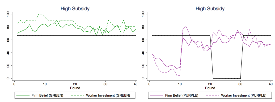
Figure 5: Firms' beliefs and workers' investment decisions in the High Subsidy treatment