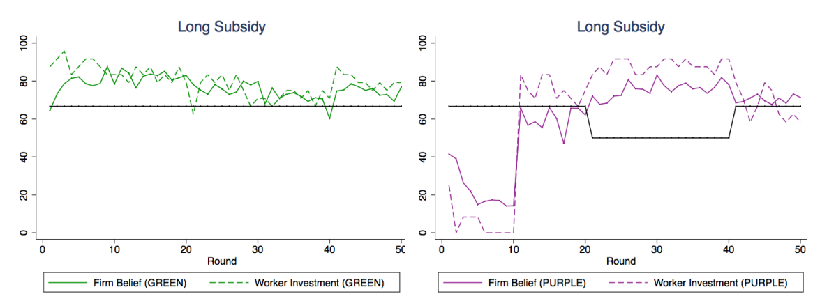
Figure 6: Firms' beliefs and workers' investment decisions in the Long Subsidy treatment