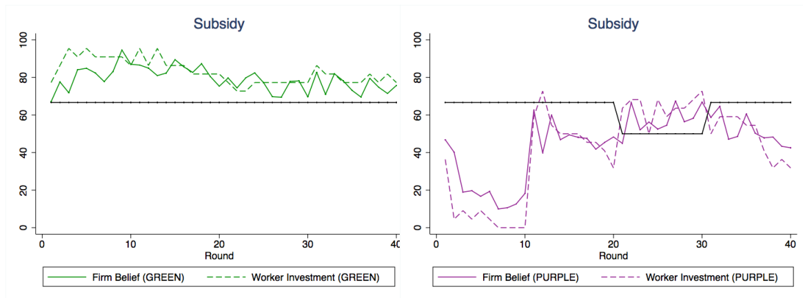
Figure 4: Firms' beliefs and workers' investment decisions in the Subsidy treatment