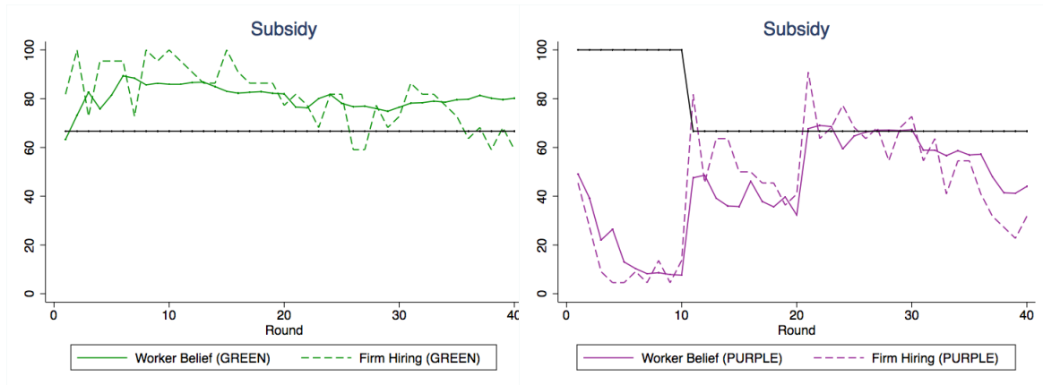
Figure 1: Workers' beliefs and firms' hiring decisions in the Subsidy treatment