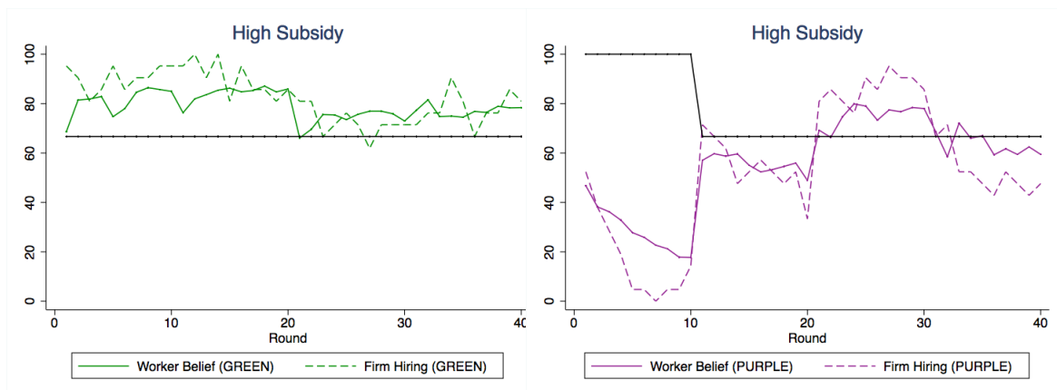
Figure 2: Workers' beliefs and firms' hiring decisions in the High Subsidy treatment