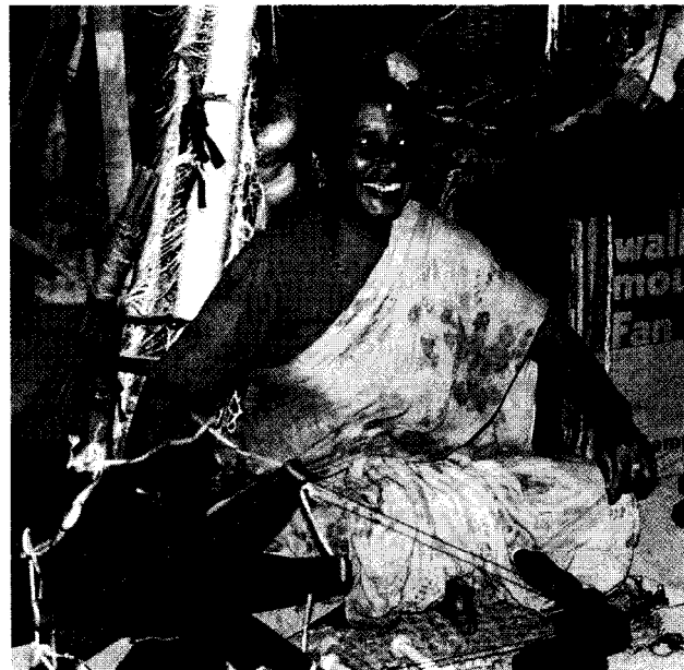
Wool spinning at the Association for Craft Producers in Nepal

By reducing pollution, the project will benefit women both in their role as factory workers, since the factories are now much cleaner, and also because of the overall improvement in environmental conditions around Concepción. The initiative of the women at the university, and their effort to involve women throughout the fish meal industry, has created a very positive image for professional women in the industry. This is already generating new professional and managerial opportunities for women, as well as giving them new confidence. On the basis of the success to date, the 17 factories have invested US$ 350,000 in the next stage of the project, and work has started to replicate the project in six other sites in Chile; in Peru; and in the Ecuadorian shrimp industry.