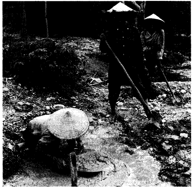
Gold mining in Viet Nam: processing gravel at Song Hieu

Women typically make up 40 per cent of the workers in artisanal mines, where they endure hard physical labour. They also comprise the majority of the workers performing mercury amalgamation, where they are unprotected against exposure to the toxic metal. They are usually not even aware when they are suffering from mercury poisoning, since the initial symptoms are very similar to those of malaria.