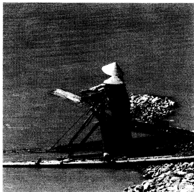
Gold mining in Viet Nam: women drag/hers at Tan An