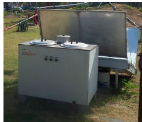
A collector cooker. Mirrors are added to increase the amount of sunlight falling on the collector.

Collector cookers consist of two parts. A collector and a cooking range. The collector can be placed outdoors, while the cooking range can be located in the kitchen. These cookers make use of diffuse and direct solar radiation. They are, however, rather complicated to build. The collector cooker can use air or steam for the heat collection, but also a liquid like oil can be used. In that case, the heat can be stored for a short period of time. This period is often not long enough to be able to cook in the evening. Temperatures of up to 150 °C can be reached when a liquid like oil is used. These types of cookers are typically expensive compared to the other types.