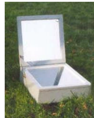
A box cooker.

The box type solar cooker doesn't reach very high temperatures (no frying or roasting is possible) and should remain closed during cooking, which makes stirring or adding of ingredients impossible. Therefore, the solar box cooker can be used to prepare for example rice or lentils over a time period of a few hours during the day when the user is out at work. When the user returns the food will be ready.