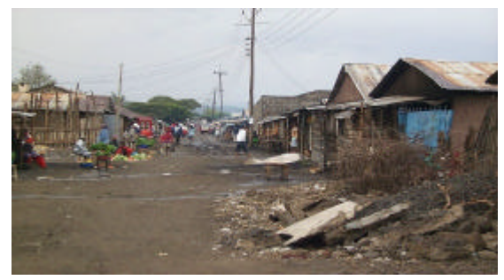
P0001013 Street scene in one of the slums of Nakuru, showing the lack of formal infrastructure

In Nakuru, Mama Susan is aware that the neighbourhood she lives in shows many of the characteristics typical of such settlements. It is not very safe or healthy. She has lost no less than four children; their early deaths may well have been related partly to the poor living conditions in her settlement.