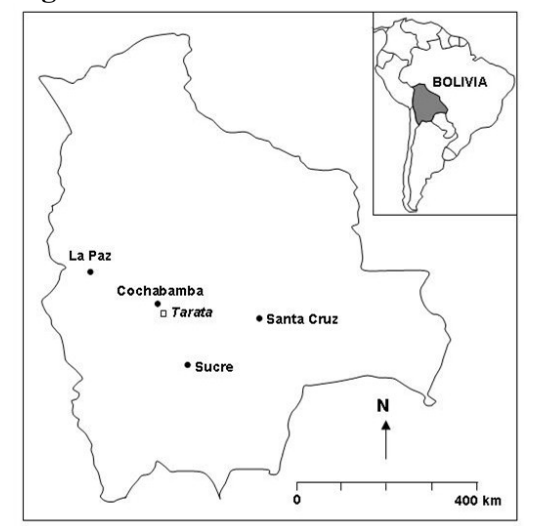
Figure 1 Location of Tarata in Bolivia

The area around Tarata has a long history. The first known inhabitants, Tiawanacota , were pre-inca. Later, Aymara - and Quechua -cultures prospered. During the colonial period, from the late 16<sup>th</sup> century, the area became an important supplier of food for the mining area of Potosí, and Tarata became an important religious centre (Vargas, 1999). Arbieto was founded during this period. Products were made for regional and international markets, and today the area is still known for producing fireworks, pottery, crystal bottles and soap.