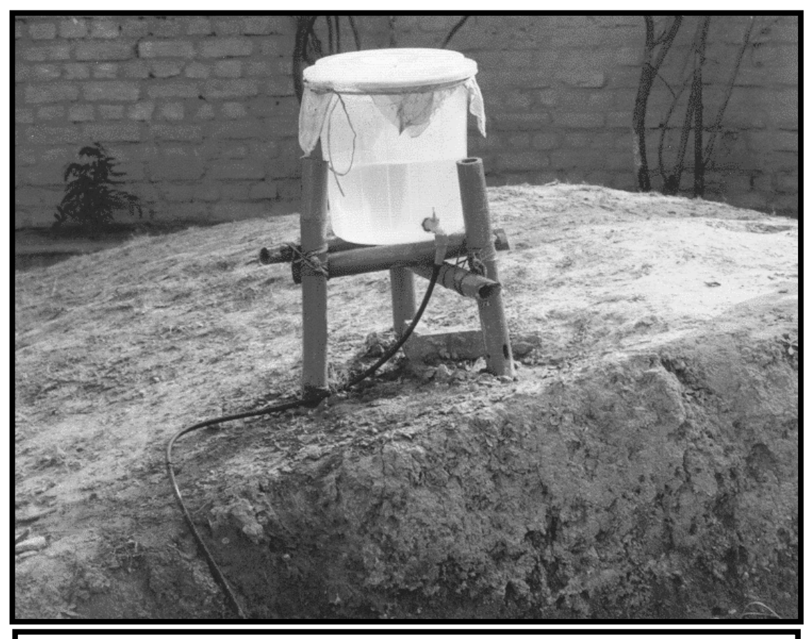
The bucket kit for low cost drip irrigation in the test laboratory of IDE India near New Delhi. A simple product with a long trial and error phase to make it suited to the needs of poor horticulturists.