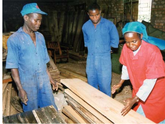
A woman MCP advisor in a carpentry shop