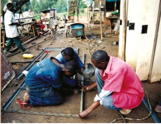
MCP advisor in a metal workshop

Essential in this strategy are the dynamics of communal obligations as the driving force, which work in a way that business people in the same business community help each other. However, clients were not used to paying fees for training and advisory services, sometimes affected by heavily donor-subsidized services. The UNIDO project has not given any financial incentives or subsidies to the MCP, but helped in the conceptual development, preparation of methodologies and manuals, training of advisors and campaigning for the fee-based services.