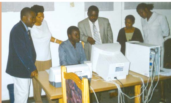
Staff of the Balcão Único explaining their work to visitors