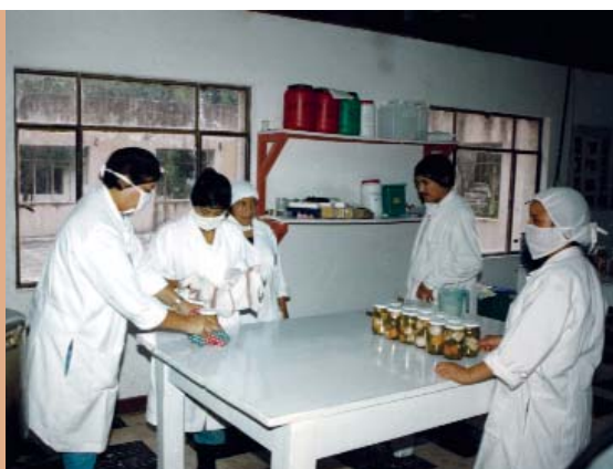
Food processing as a business opportunity