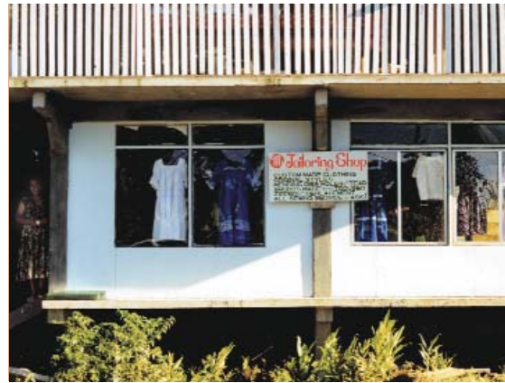
Federated States of Micronesia: this tailorshop in Kosrae State opened with MEDC assistance

With the establishment of Micronesian Entrepreneur Development Centres (MEDC) in four states (Pohnpei, Chuuk, Kosrae and Yap), the project built a network of institutions offering training programmes, business and technical advisory services and business information to the