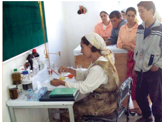
High quality for competitive products

processing of figs, prunes, medicinal and aromatic plants. In the past, traditional weavers exclusively used artificial fibres, thus attaining only low prices for their products. Almost 20 per cent of olive oil was lost due to inefficient production methods and the high acidity in the oil was hazardous to the health of the consumers. No processing of figs and prunes took place. The fruits thus had to be sold on local markets at low margins or perished quickly.