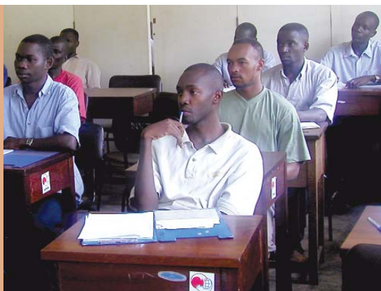
Secondary school students in Kampala taking an entrepreneurship development course

The Nakawa Vocational Training Institute (NVTI) located in Kampala thought it was useful to combine the vocational training with entrepreneurship training. NVTI hoped that some students would become interested in starting their own business after some years of employment by using the vocational skills obtained. UNIDO developed the entrepreneurship training curriculum for NVTI targeting the students of 19-22 years old and trained the instructors.