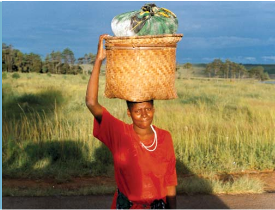
Woman on the way to a maize mill

Gender equality is a prerequisite for poverty reduction because of the contribution women make and the role they play in society and in the economic well-being of the family and communities. Be it in rural or urban areas, be it in micro or medium and large enterprises, women must be an integral part of development, not only as beneficiaries, but also as decision-makers and agents of change.