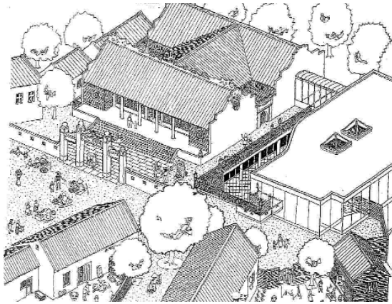
The image of the "Traditional Craft Village"