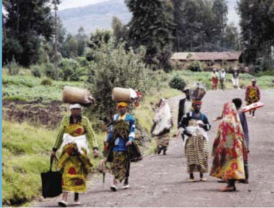
People are the asset of the future

Poverty-reducing growth strategies need to diminish policy and regulatory obstacles that discourage local entrepreneurial initiatives and to