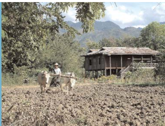
Need to diversify economic opportunities for a better life

The rural non-farm economy plays an important role for wealth creation and well-being across countries. For example, small rural households with fewer than 0.5 hectares earn over half of their total income from non-farm sources. The composition is generally one-third manufacturing, one-third commerce and services with mining and construction accounting for the rest.