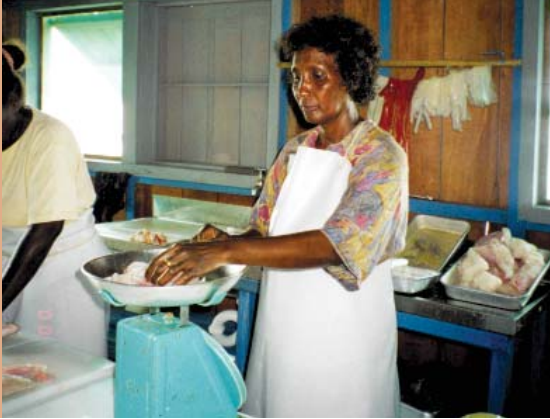
Solomon Islands: A community-based business venture

were trained to carry out the services for the entrepreneurs. More than 1,200 entrepreneurs received training or other assistance.