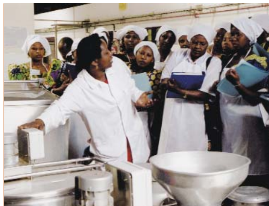
Rwandan entrepreneurs work together in dairy production

processing in Byumba and Kigali Rural Prefectures. Ten of them obtained credit from local development banks for expanding their business and two of them successfully marketed their products into the urban market in Kigali.