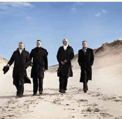
Emerson String Quartet

Make check payable to Caltech Mail to: Ticket Office, Caltech (332-92) Pasadena, CA 91125 or Fax: 626.395.1721 Phone: 626.395.4652 E-mail: events@caltech.edu