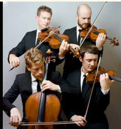
Calder Quartet