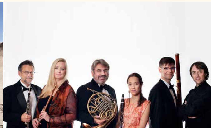
Chamber Music Society of Lincoln Center