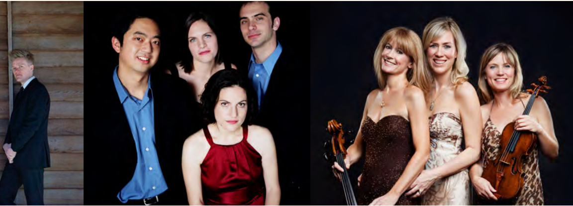
Jupiter String Quartet