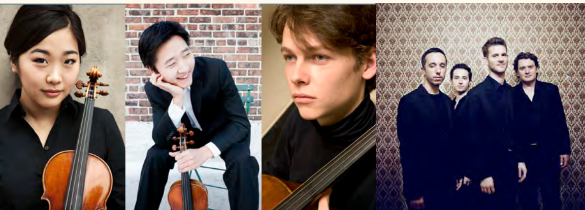
Chamber Music Society of Lincoln Center

Korngold — Piano Quintet in E Major, Op. 15