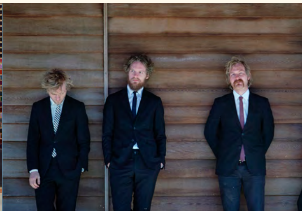
Danish String Quartet