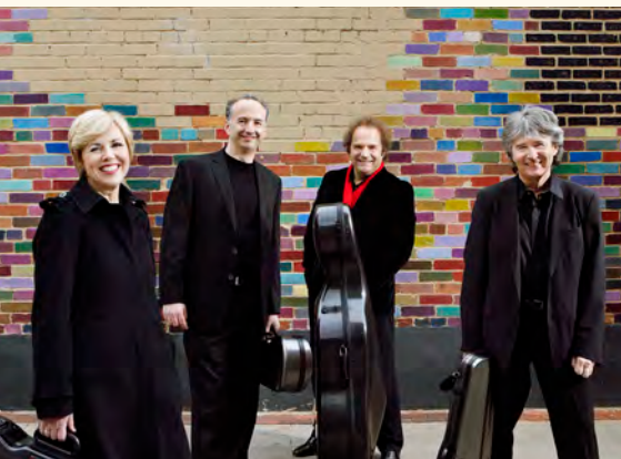
Takács String Quartet

Beethoven — Quartet in B-flat Major, Op. 130