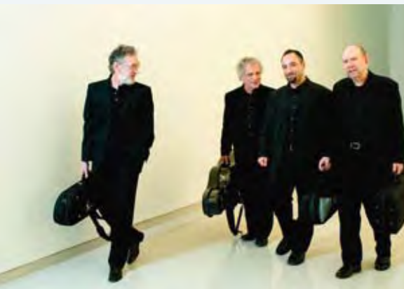
JUILLIARD STRING QUARTET

"There is a complexity of texture in a group with a history as long and layered as this one's. You can hear, as it were, the generations mingling; it's a little like being able to pick out the individual spices in a sauce while also tasting the blend as a blend." ( San Francisco Classical Voice ) This will be the Quartet's 20th appearance on the Coleman series.