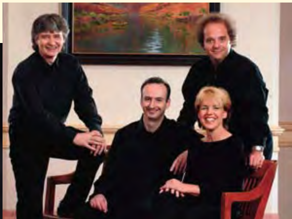
TAKÁCS STRING QUARTET