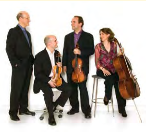
SCHUBERT ENSEMBLE OF LONDON