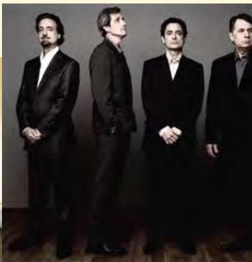
EMERSON STRING QUARTET