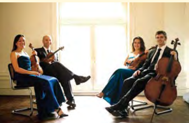
ENSO STRING QUARTET

"It didn't take long for me to determine that I was privy to extraordinary talent . . . replete with enthusiasm and momentum and, drawing upon a winning combination of instinct and convention, they evoke not only a distinct personality, but also exhibit poise, coupled with an exceptional sense of vitality and elegance. The energy generated by these young musicians is obvious from the get-go, as is the commitment to the repertoire." (Fanfare MAGAZINE)