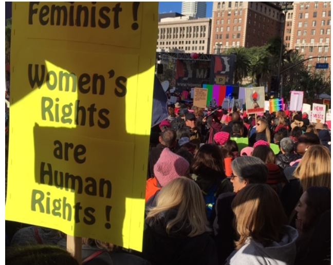
Women's Rights are Human Rights!

"Resistance is fertile." The sign's creator bordered the saying with artificial flowers.