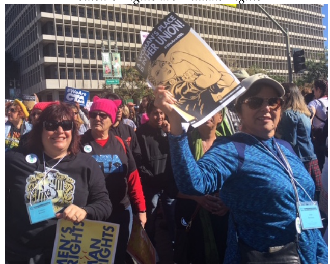
CTA (California Teachers Association).

Diversity ruled the day. Families with tiny babies in front packs walked along side old people. I saw many families with young children. If I were close enough to any of them, I'd say, "Start 'em young," and the grown up would smile and agree. One woman said, "He has to understand." And of course, along with the age spread, the entire tapestry woven from the multitude of threads that make up the fabric of the United States was present.