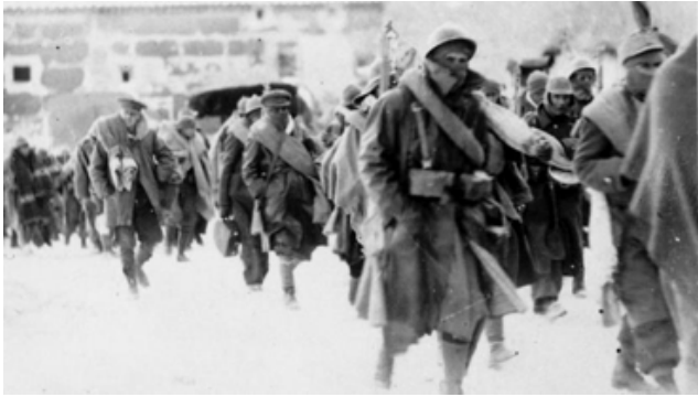
Teruel, the coldest battle of the war.

The tragic story of the Americans in the doomed Lincoln Brigade -- who bore some of the toughest fighting and heaviest casualties of any unit -- comes vividly to life in Adam Hochschild's compelling "Spain in Our Hearts," a long-overdue book that explores this long-overlooked conflict.