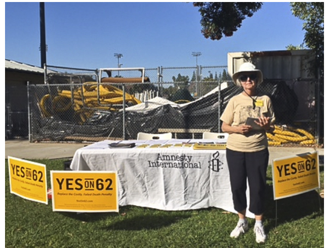
Candy with brochures at the ready

We are going to table again on November 5, so if you'd like to spend some time in the fresh air and make new friends, please let us know.