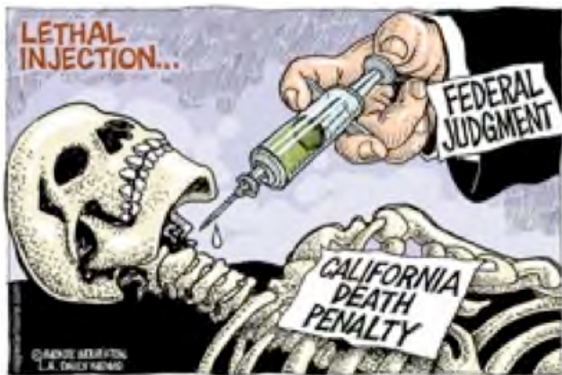
reprinted by permission of the artist

For now, let's celebrate Judge Cormac J. Carney's decision and know the discussion will continue.