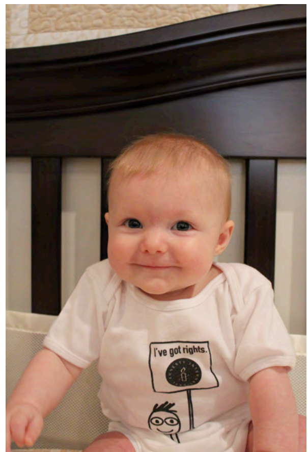
Our newest member...what a cutie!