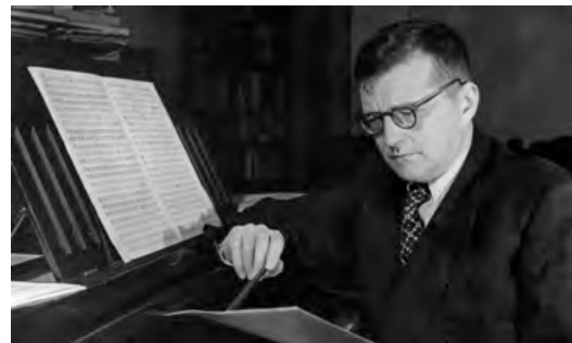
“The breadth of a whole life within the pages of a slim book”: Dmitri Shostakovich in 1950.

Julian Barnes's last novel, the Man Booker-winning The Sense of an Ending (2011), engaged in subtle and sustained dialogue with the book whose title it pilfered, Frank Kermode's brilliant 1967 work of narrative theory, also called The Sense of an Ending . Barnes's latest, The Noise of Time , borrows its title from Osip Mandelstam's memoirs, and again the earlier work casts interesting light upon Barnes's project. Mandelstam was one of Stalin's most outspoken critics, his fate sealed with the words of his 1933 Stalin Epigram. He was exiled in the Great Terror and died in a Vladivostok transit camp in 1938. The subject of The Noise in Time is not the brave, doomed Mandelstam, though, but a rarer genius, one whose art continued to flourish despite the oppressive attentions of the Soviet authorities: Dmitri Shostakovich.